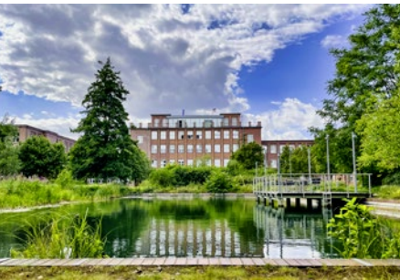
UFZ Location Leipzig

The Helmholtz Centre for Environmental Research – UFZ was established in 1991 and has more than 1,100 employees in Leipzig, Halle/S. and Magdeburg. They study the complex interactions between humans and the environment in cultivated and damaged landscapes. The scientists develop concepts and processes to help secure the natural foundations of human life for future generations.