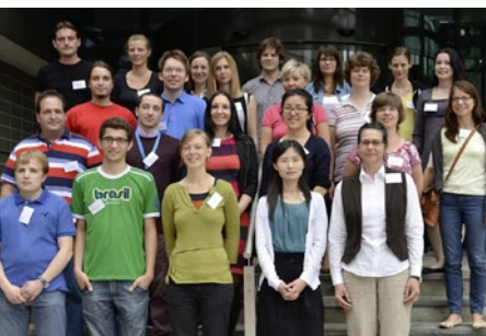
The UFZ-Welcome Day

Your research host at UFZ will help you with your first phase in Germany. Please arrange for your research host or another member of the working group to pick you up at the airport/station or to meet you at the main entrance of UFZ.